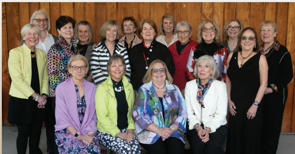
ARCS Pittsburgh board and committee members