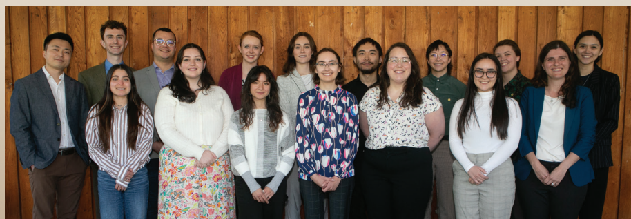
ARCS Pittsburgh Scholars